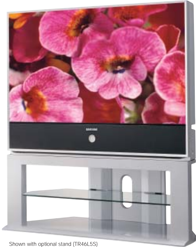
Shown with optional stand (TR46L5S)

46" Wide Screen HDTV Monitor Television with DLP™ Technology