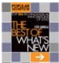
2002 Grand Award Winner